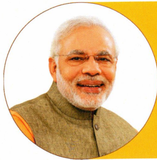
Shri Narendra Modi Prime Minister of India

“ Skilling is building a better India. If we have to move India towards development then Skill Development should be our mission. ”